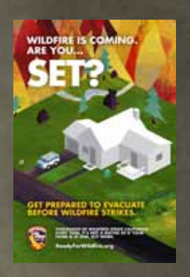
Step 2: Are You Set?

Creating defensible space and hardening your home against wildfire.