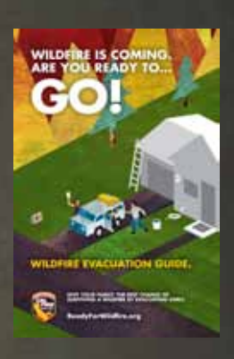
Step 3: Are You Ready to Go?