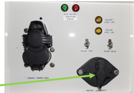
12/24-Volt Vehicle Master Disconnect (shown in OFF position)