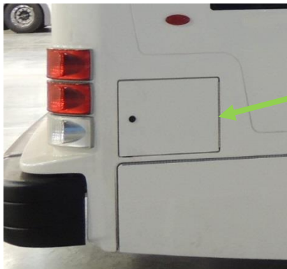
Curbside Rear Access Panel