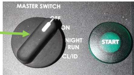
Master Switch (OFF Position shown)