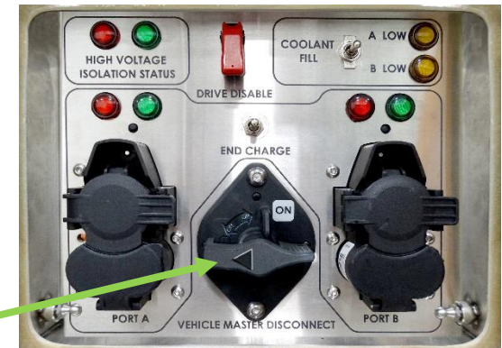
12/24-Volt Vehicle Master Disconnect (shown in OFF position)