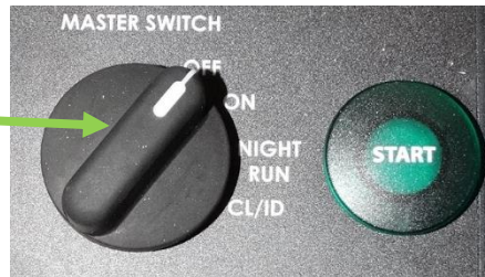
Master Switch (OFF Position shown)